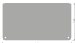
EM EXIT PICTO BLANK